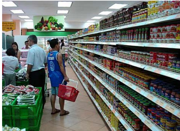
A joint initiative by